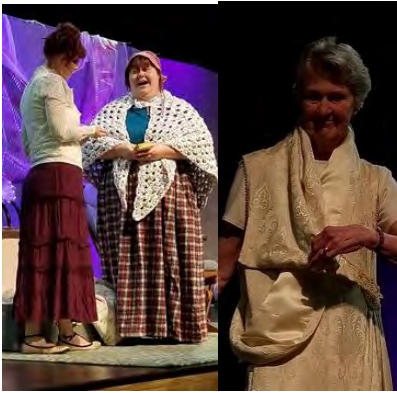
4 th Annual Fashion Show & Afternoon Tea