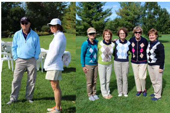
21 st Annual Charity Golf Tournament